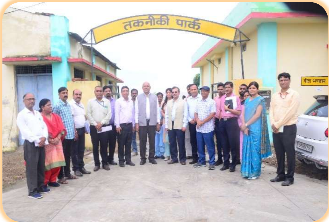
KVK Barabanki field visit by ICRO team