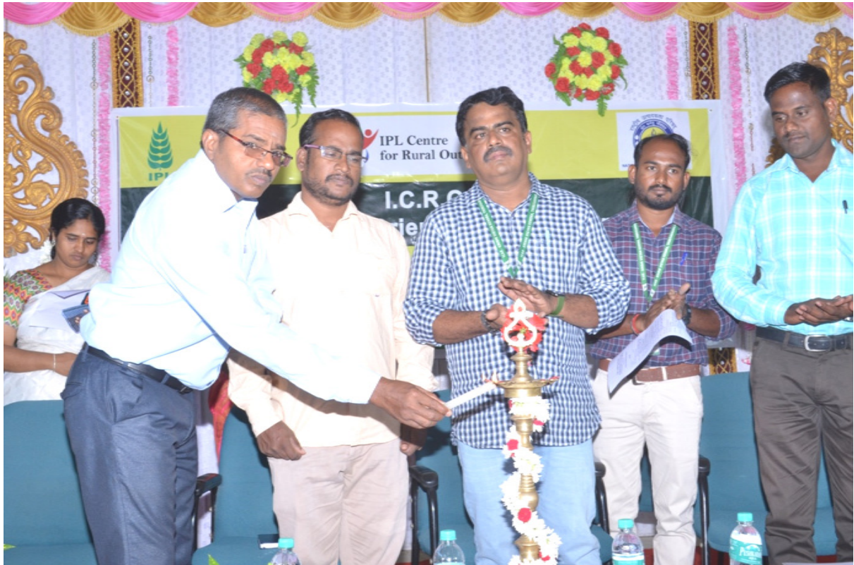
Lighting of Lamp during inauguration by all officials