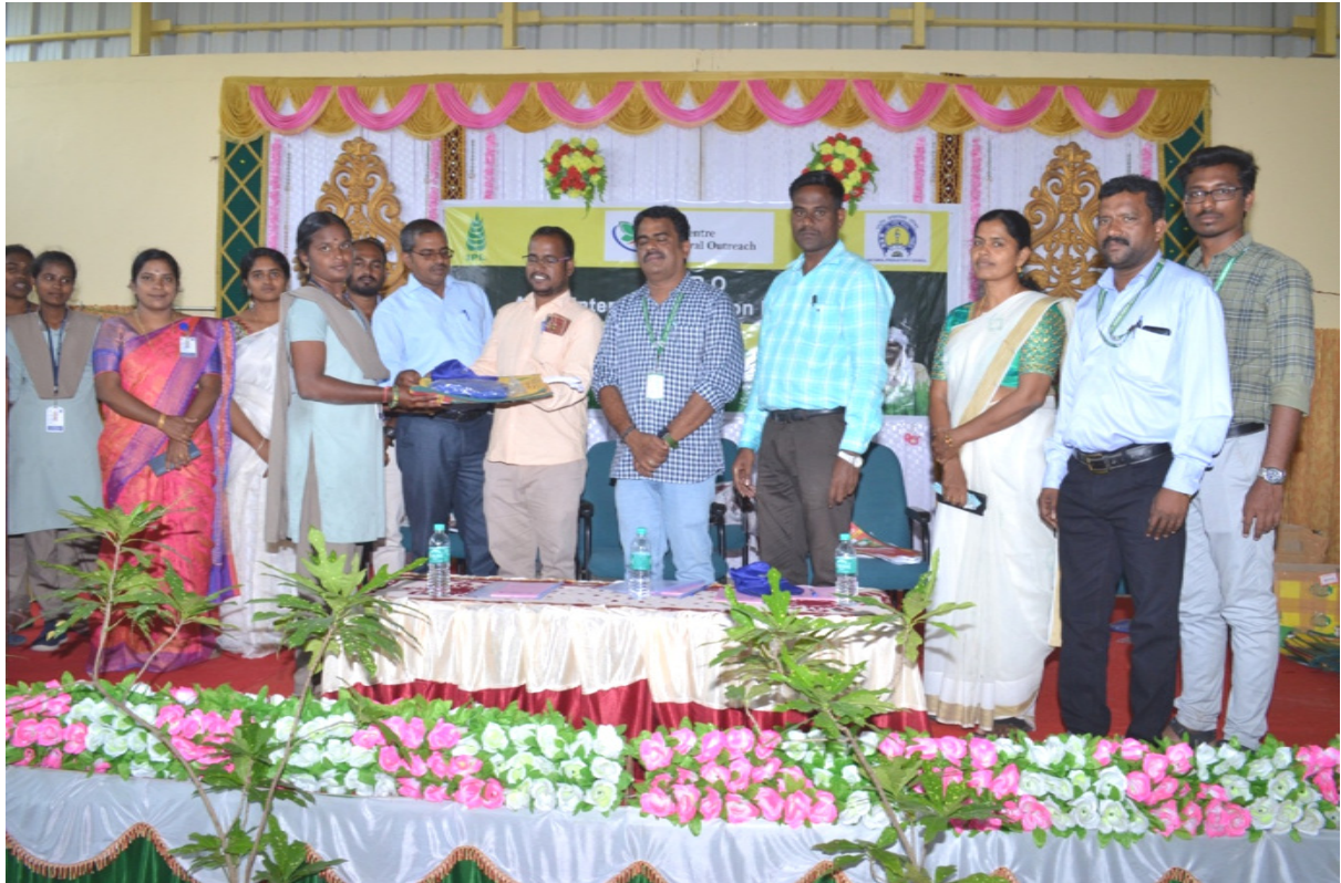
Distribution of IPL kit to all the interns