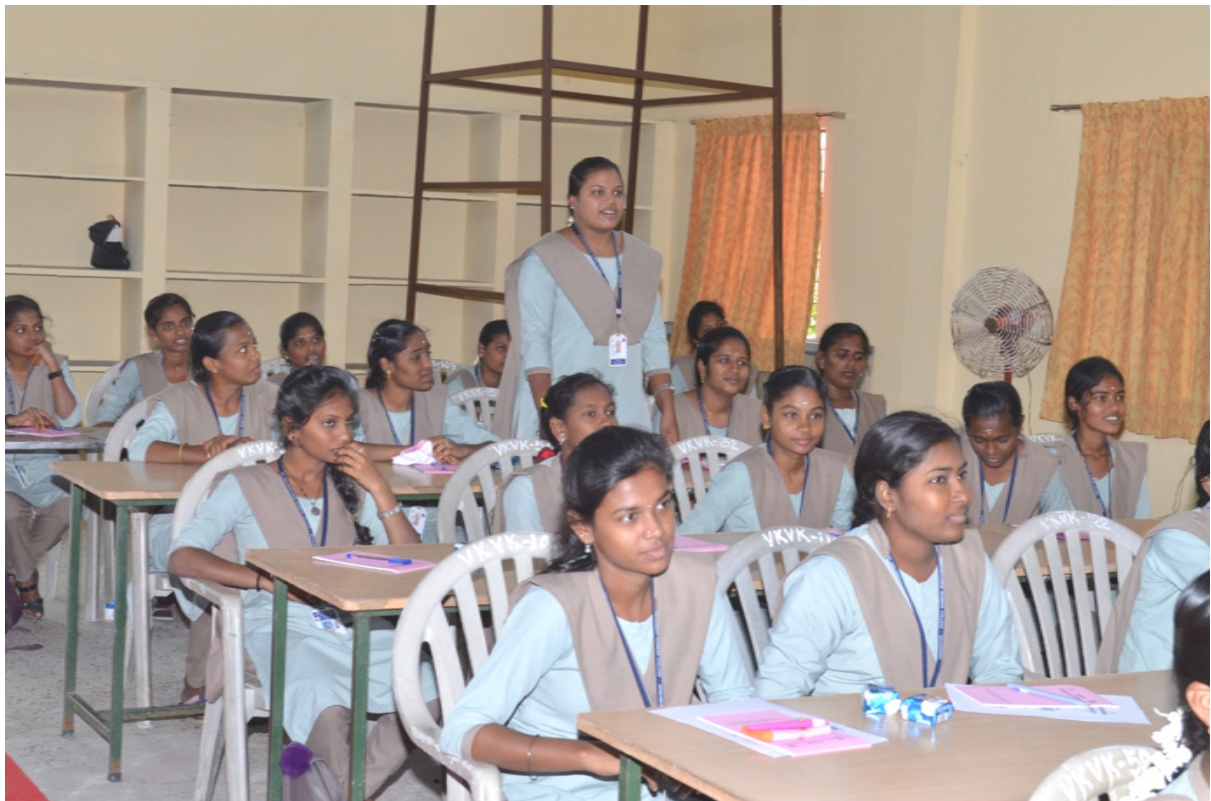
Interaction of Interns with Experts during orientation programme