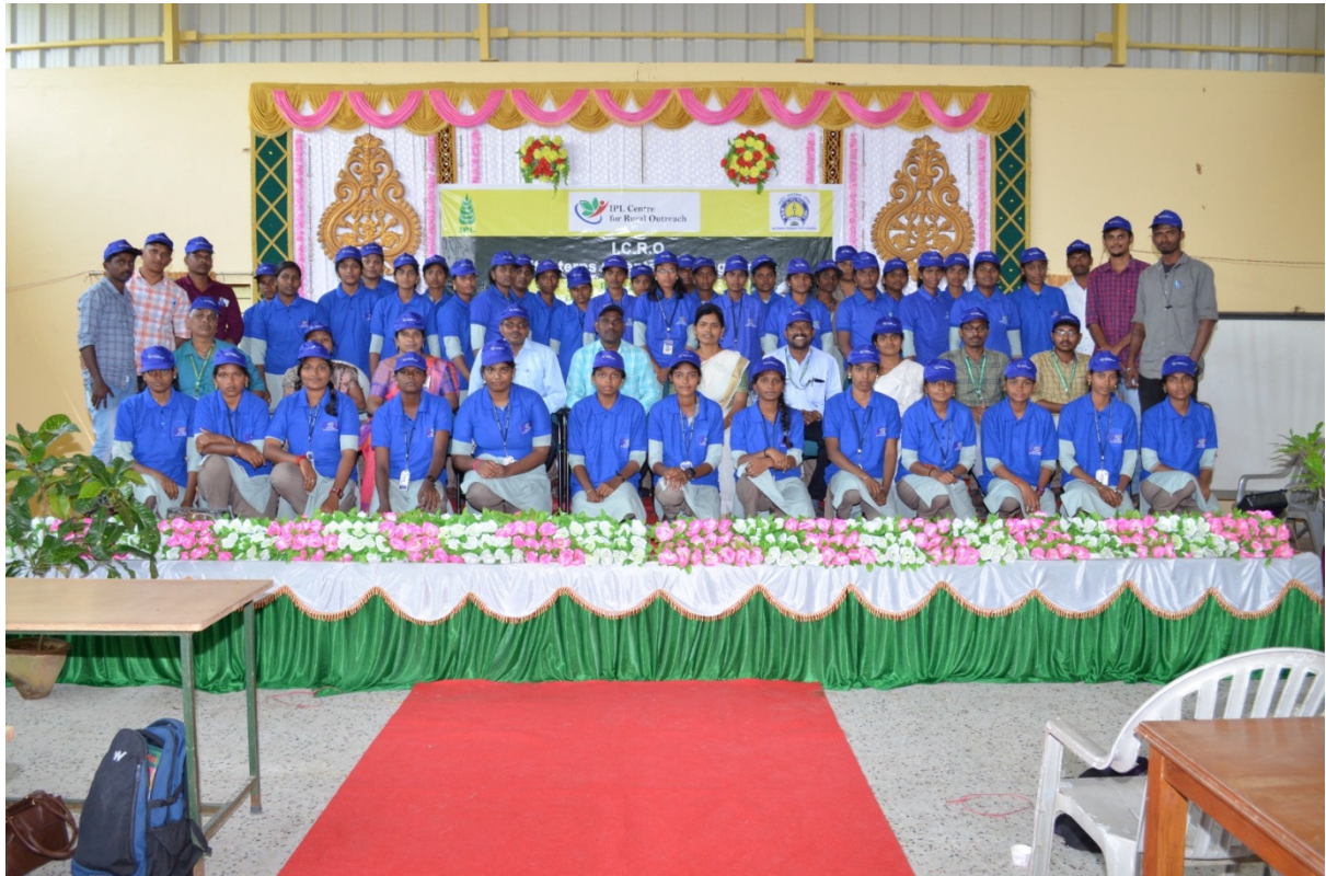
Group Photo of selected Intern with Officials