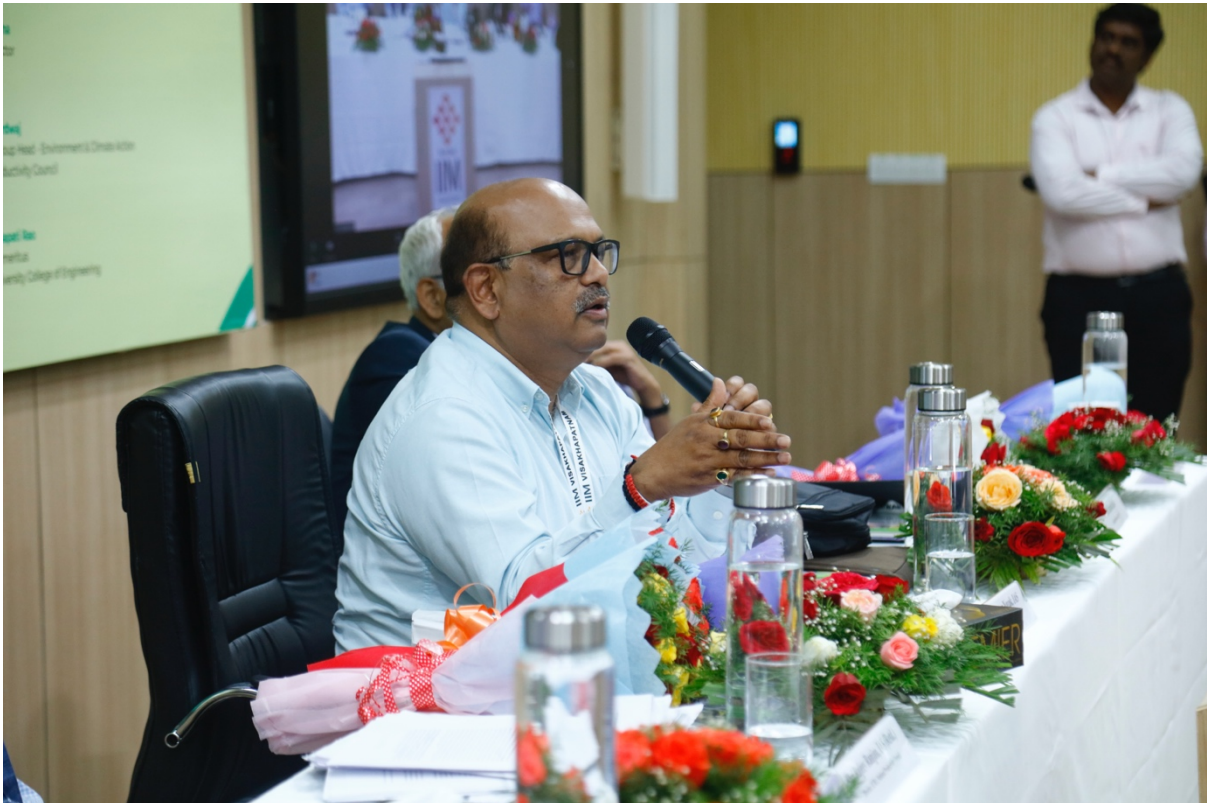
Figure 30: Shri Sundeep Kumar Nayak, DG-NPC answering one of the queries from the audience