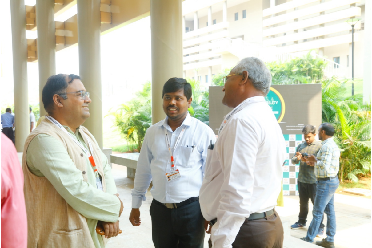
Figure 5: Participants Networking Prior to the start of the event