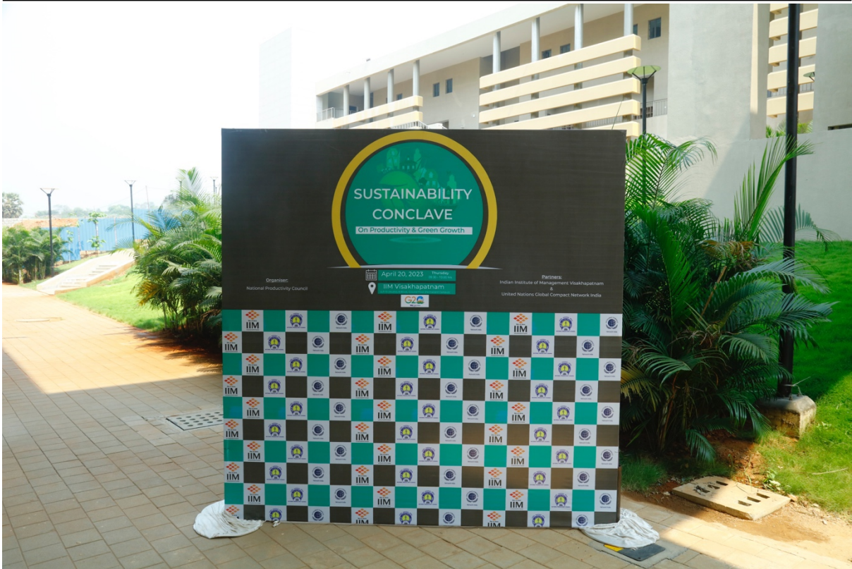
Figure 9: The Selfie booth near the registration desk