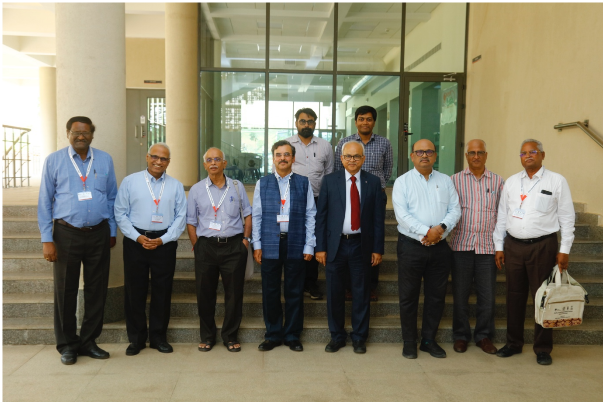
Figure 2: Senior Academicians along with the Dignitaries on the side-lines of the event

This conclave brought together practitioners, policymakers, academicians, and researchers to discuss ways in which green growth could ensure enhanced productivity without compromising the country's economic growth targets. Consequently, some of the topics discussed included 'Sustainability Opportunities, Challenges and Way Forward' along with the 'Green Vision of Andhra Pradesh and Green Mechanism for Sustainable Development'.