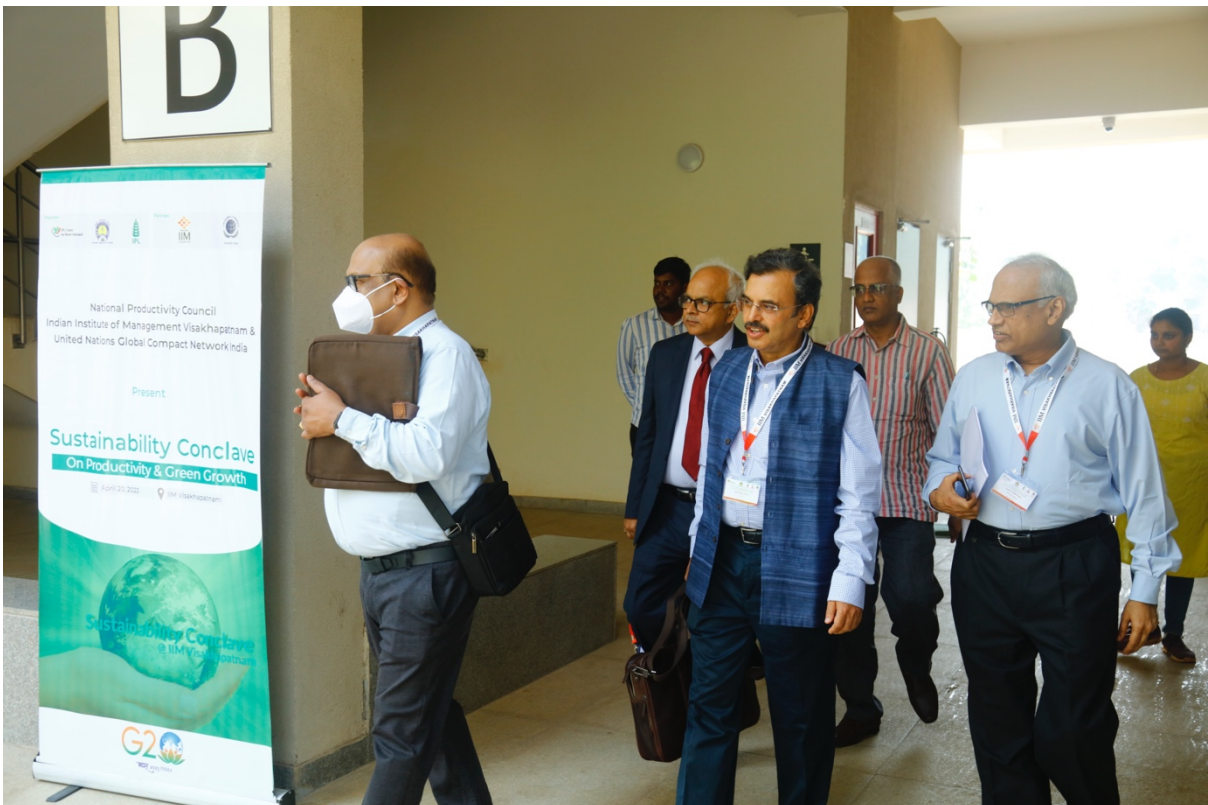
Figure 10: The dignitaries arriving prior to the start of the event