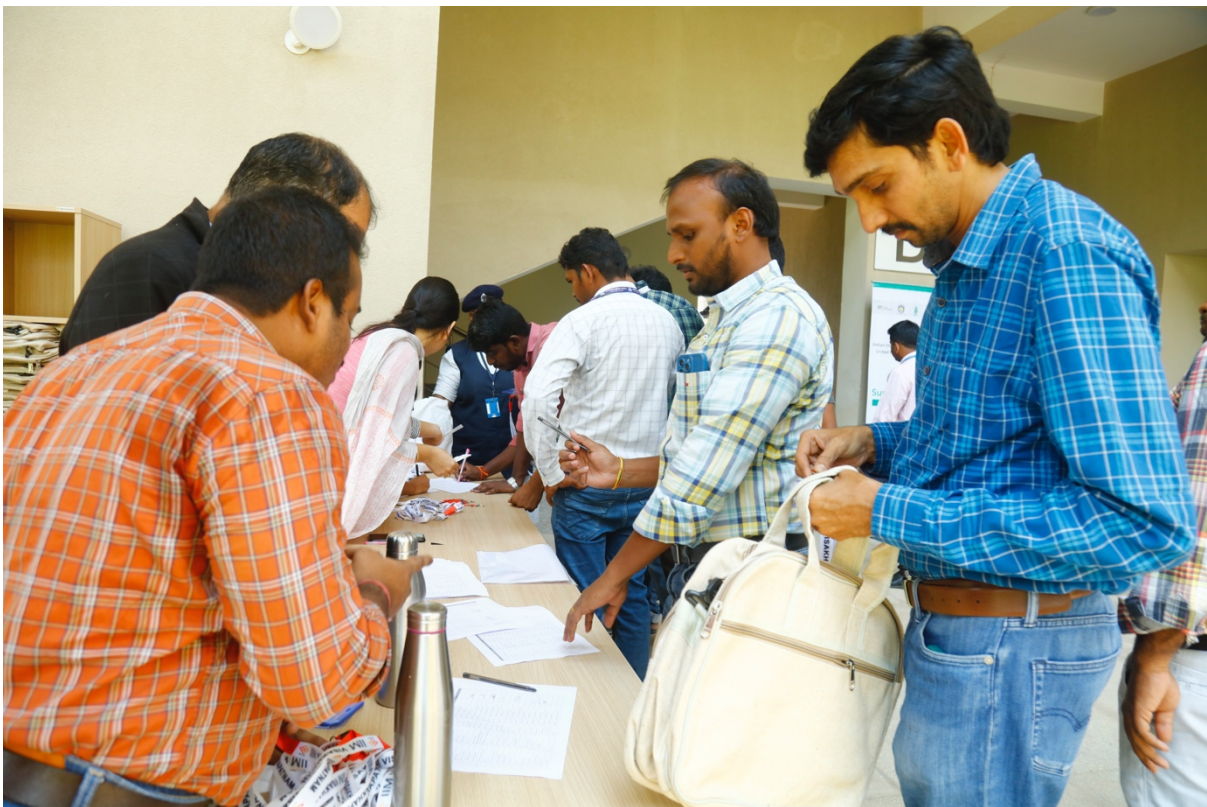
Figure 8: Participants registering before the start of the event