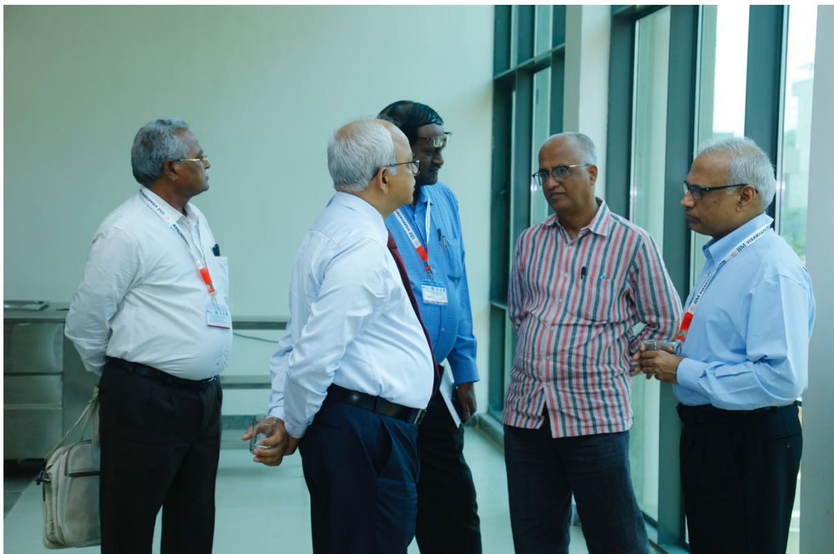
Figure 1: Senior Academicians exchanging views on the side-lines of the event

To foster green growth, investment and innovation are essential to underpin sustained growth and create new economic opportunities. Green growth should not be looked upon as a replacement for sustainable development. Instead, it provides a practical and flexible approach for achieving concrete, measurable progress across its economic and environmental pillars while taking complete account of the social consequences of greening the growth dynamic of economies. The focus of green growth strategies is ensuring that natural assets can deliver their full economic potential sustainably. That potential includes providing critical life support services – clean air and water and the resilient biodiversity needed to support food production and human health. Natural assets are not infinitely substitutable, and green growth policies take account of that.