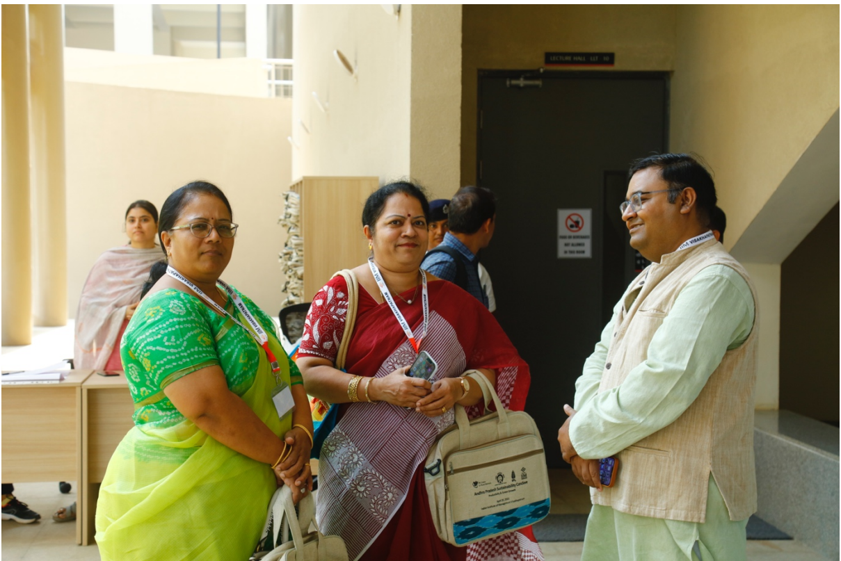
Figure 6: Participants Networking Prior to the start of the event