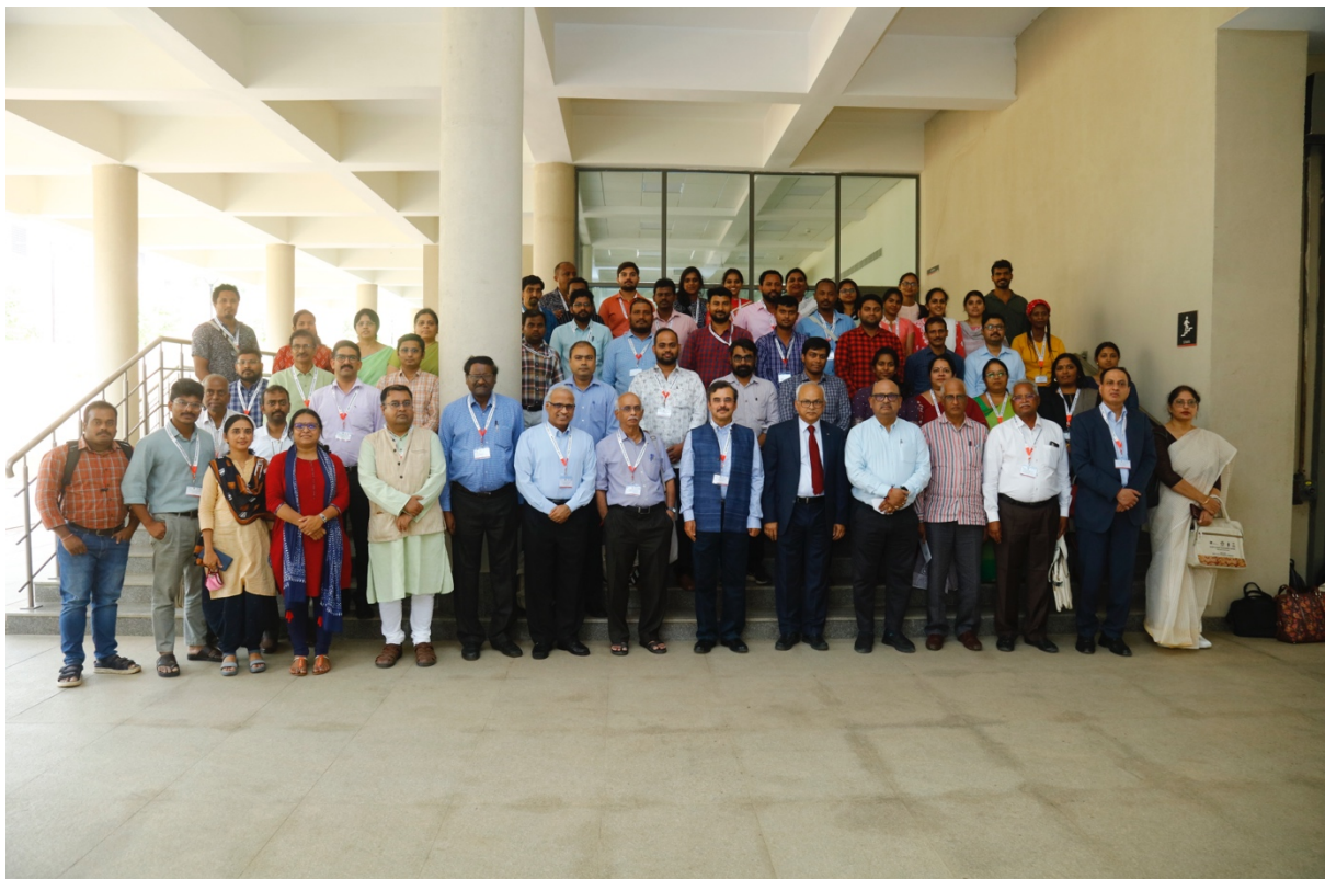
Figure 36: Group Photograph with a section of the participants at the end of the event

Overall, the event was an informative and engaging platform for policymakers, researchers, academics, and industry leaders to come together and discuss sustainable solutions for productivity and green growth.