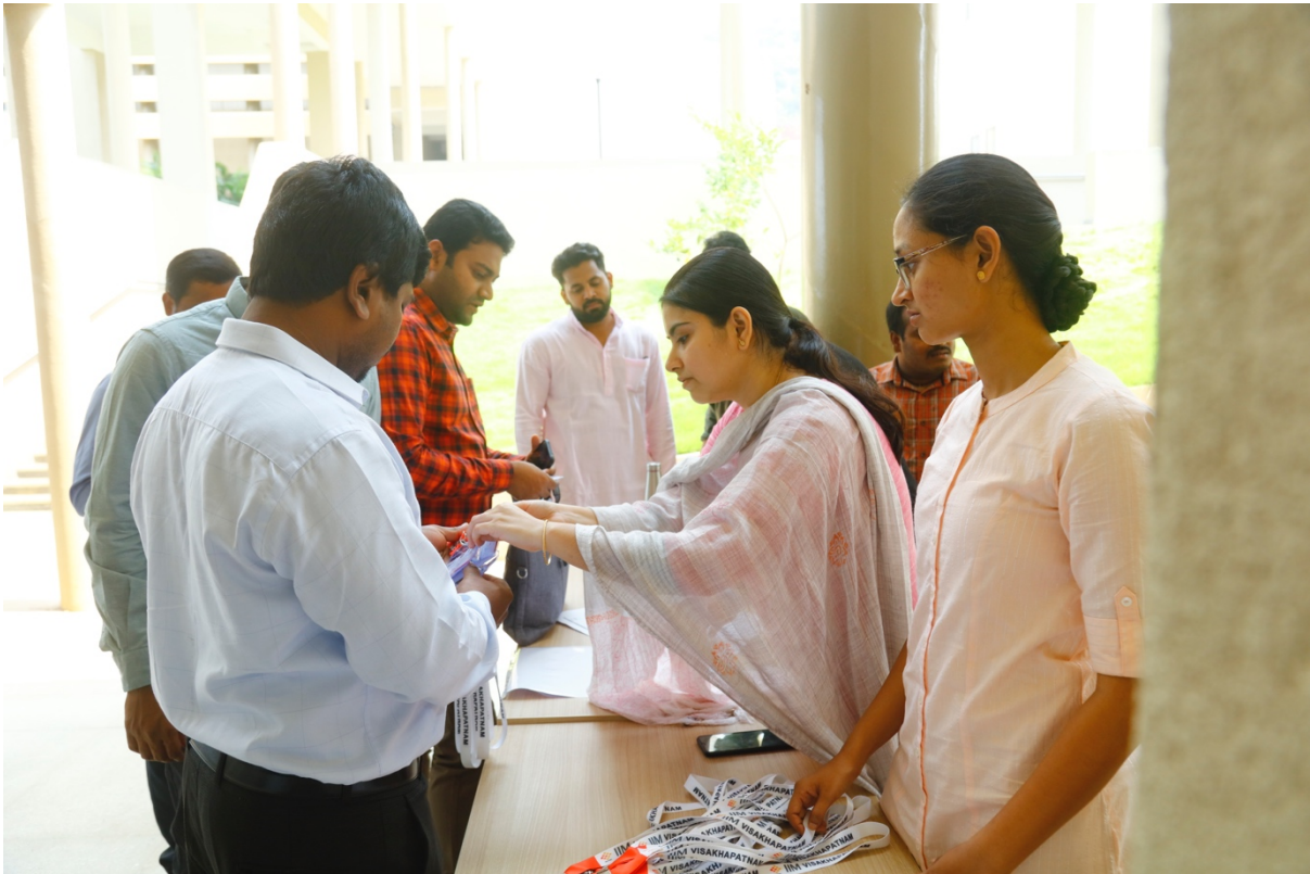
Figure 7: Participants registering before the start of the event

The participants received a small kit during the registration process as a memento from the event.