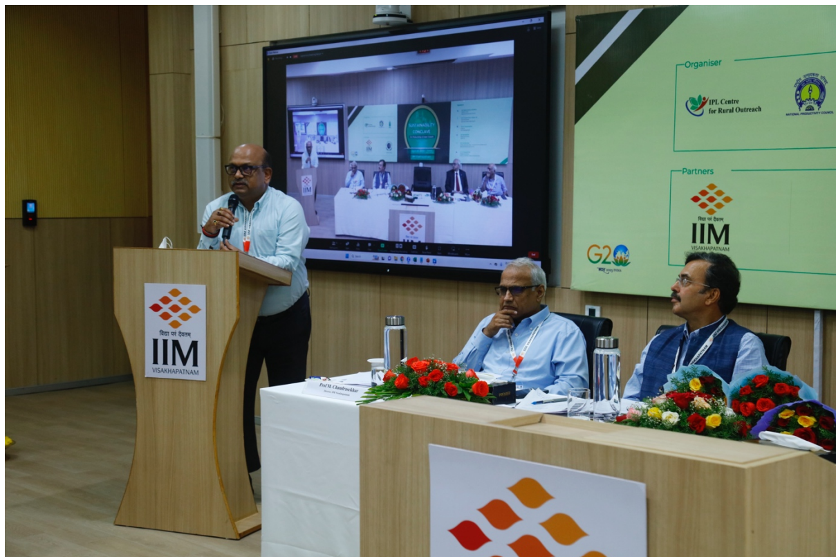
Figure 27: Chief Guest Shri Sundeep Kumar Nayak (IAS), DG-NPC, interacting with the audience

Speaking on the occasion, Sundeep K Nayak, IAS, DG-NPC reminded the gathering that “the Government of India has committed to reaching its non-fossil energy capacity to 500 GW by 2030, meeting 50 per cent of its energy requirements from renewable energy by 2030, reducing total projected carbon emissions by one billion tonnes from till 2030, reducing the carbon intensity of its economy by less than 45 per cent and achieving the target of Net Zero by 2070.”