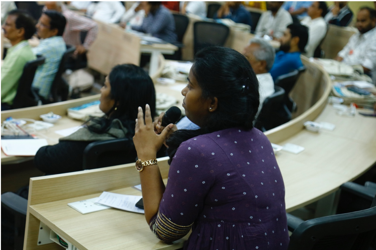
Figure 29: One of the participants asking a question to the panellists

The session was followed by a Q&A round with the participants.