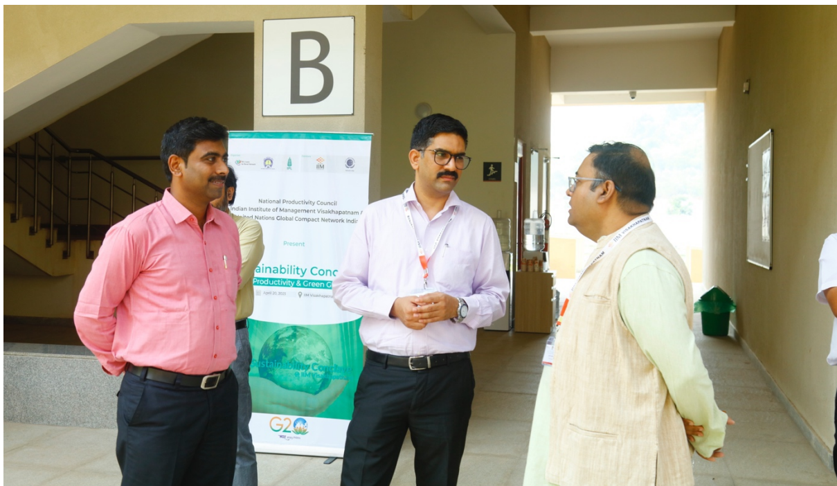
Figure 3: Participants Networking Prior to the start of the event

The event saw wide participation from corporates, research scholars and academicians from all over Andhra Pradesh. The event started with registration and networking over a cup of coffee.