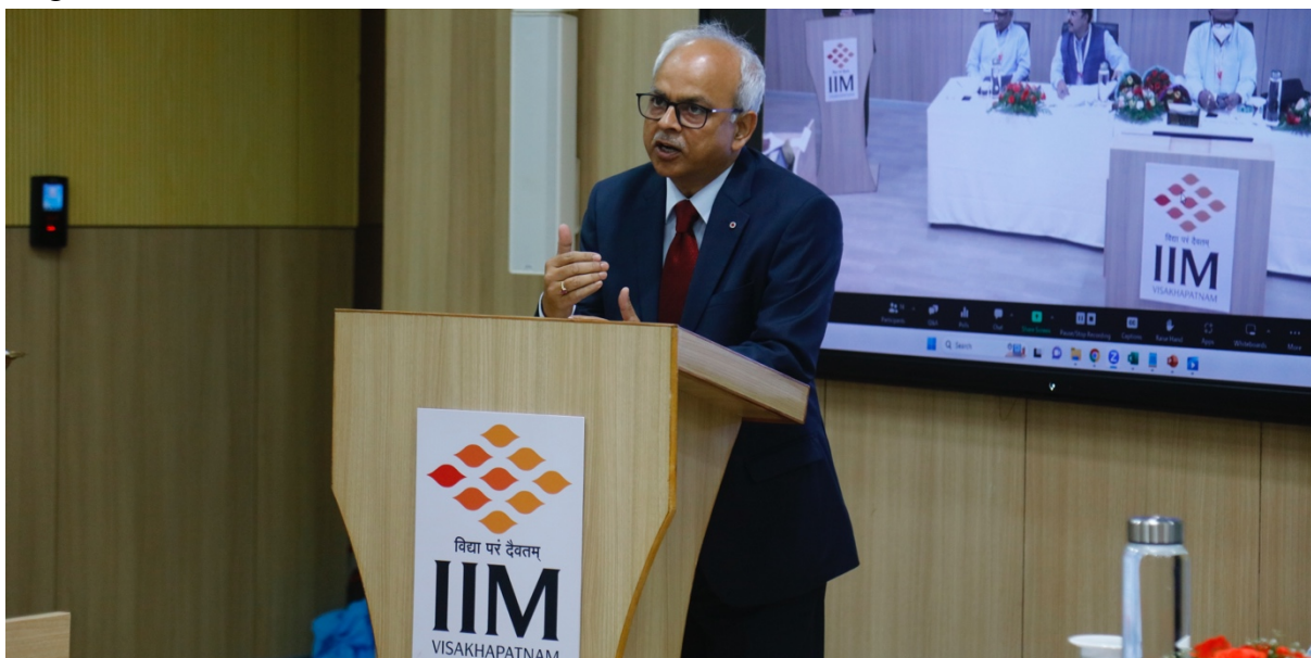
Figure 23: Shri Ratnesh Jha, ED-UNGCNI delivering the keynote address

Ratnesh ji reminded the audience about Agenda 2030. It was a call by the United Nations for people, planet and prosperity. Right now we were at the midpoint for achieving the goals set in the Agenda. Unfortunately, Corona and the Ukraine conflict had put back all the progress made so far. So the role of all stakeholders had become all the more critical in the limited time ahead. He warned that the warning of the environment had become deafening and sustainability is at the core of human resilience. He stressed that as stakeholders we must realise what is in the range within which earth can rebuild and we have to work within it.