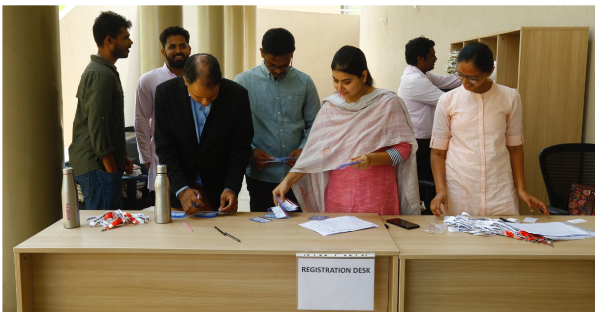
Figure 4: The registration desk getting ready to welcome the guests