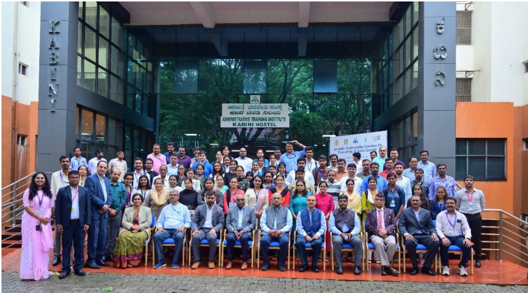
Group Photo Karnataka Sustainability Conclave on “Productivity & Green Growth” Conclave