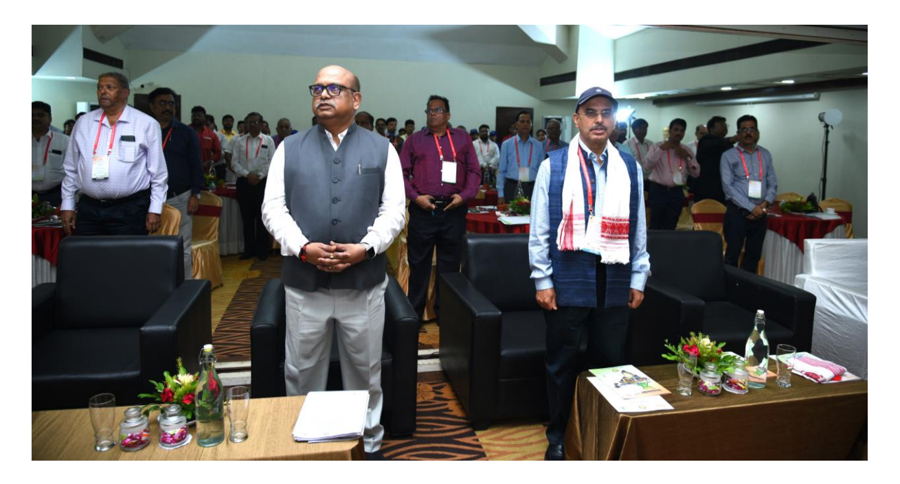
Participants Taking the Pledge of Lifestyle for the Environment

Environment day Pledge- On World Environment Day, participants were encouraged to take the Pledge of Lifestyle for the Environment, with the pledge video to be uploaded on merilife.org. This event aimed to prioritize sustainable lifestyle choices and inspire individuals to contribute to environmental preservation.