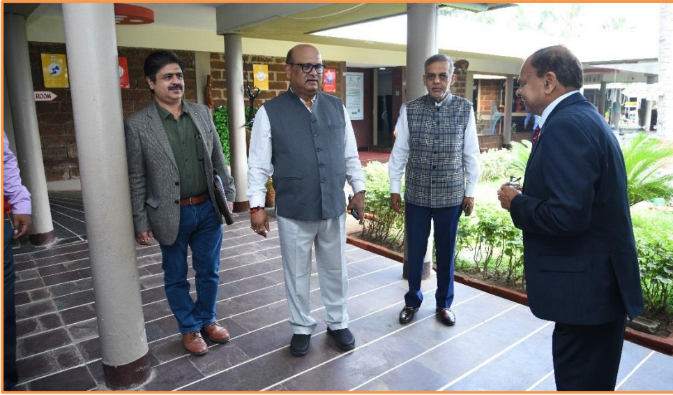
REGISTRATION & WELCOMING GUESTS