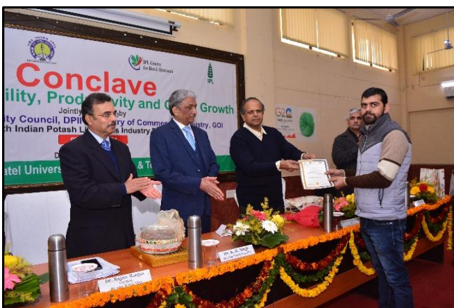
M/S Rakmo Press Pvt. Ltd., New Delhi