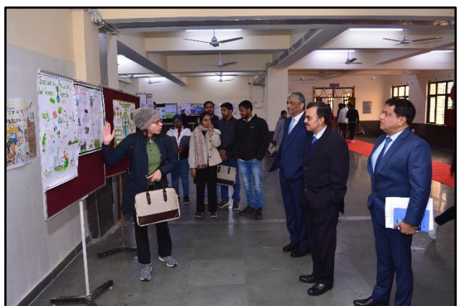
M/S Rapid Controls Pvt. Ltd., New Delhi