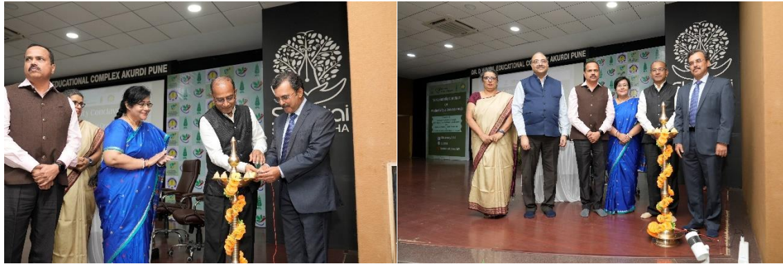
The event started with lighting of the lamp and ganesh vandana.