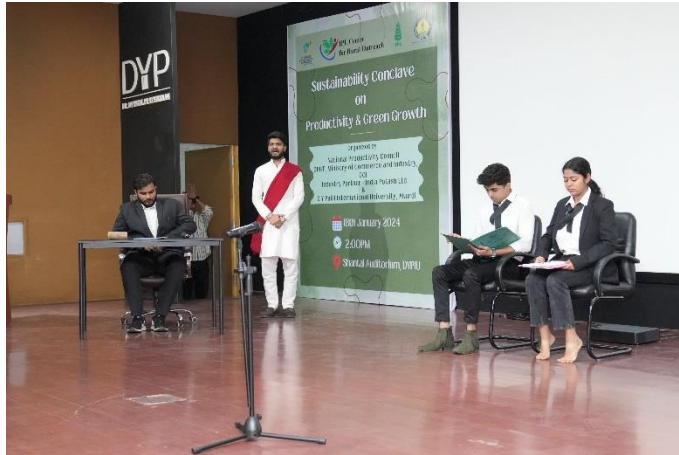
Undergraduate students of DYPIU performed a skit to create awareness on sustainability amongst their peers.