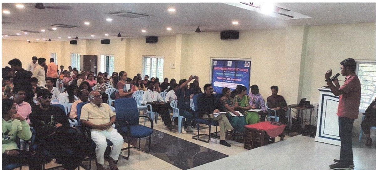
Photo: Captured during participants delivering the video presentation