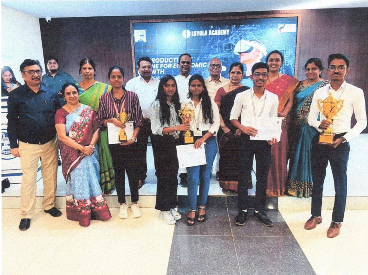
Photo: Group Photo with the winners with the chief guests, Judges & staff of Loyola Academy

THEME: ARTIFICIAL INTELLIGENCE (AI) - PRODUCTIVITY ENGINE FOR ECONOMIC GROWTH WITH A FOCUS ON AI - FOR IMPROVING AGRICULTURAL PRODUCTIVITY