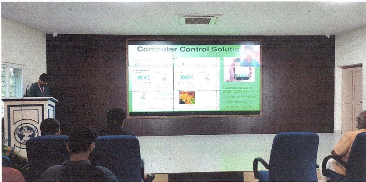
Photo: Captured during participants delivering the video presentation