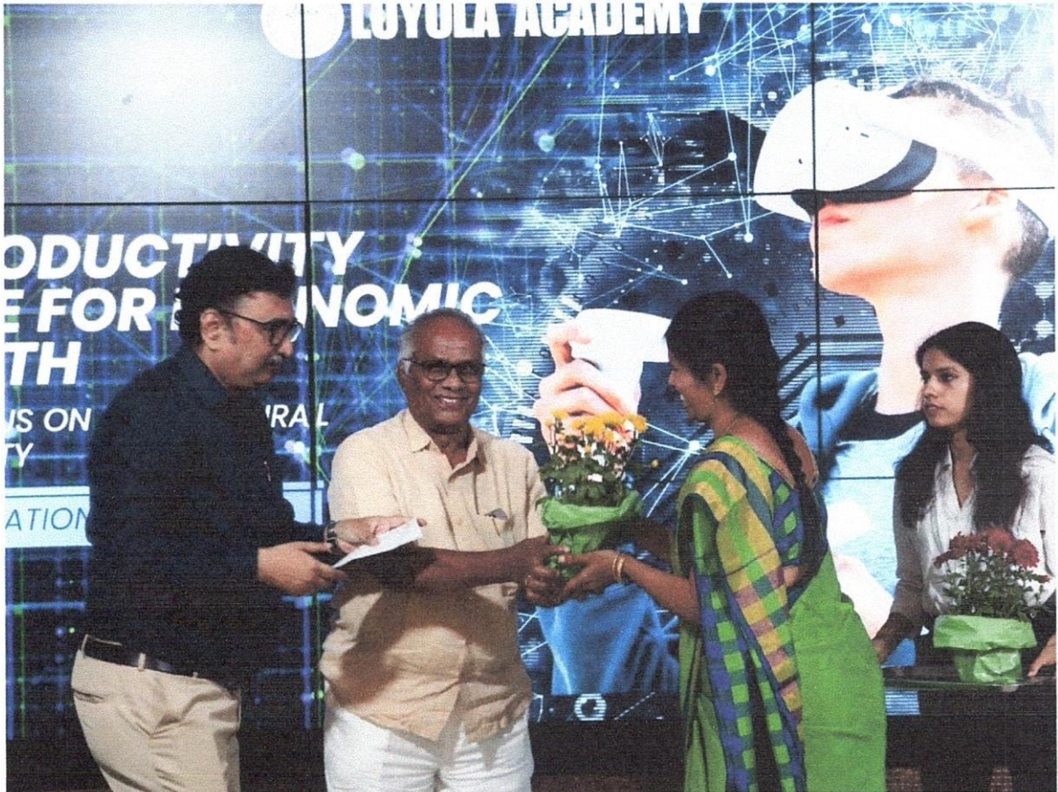
Photo: Captured during welcoming the chief guest – Shri. Puli Raja Reddy, Hony. Treasurer of Andhra Pradesh Productivity Council

THEME: ARTIFICIAL INTELLIGENCE (AI) – PRODUCTIVITY ENGINE FOR ECONOMIC GROWTH WITH A FOCUS ON AI – FOR IMPROVING AGRICULTURAL PRODUCTIVITY