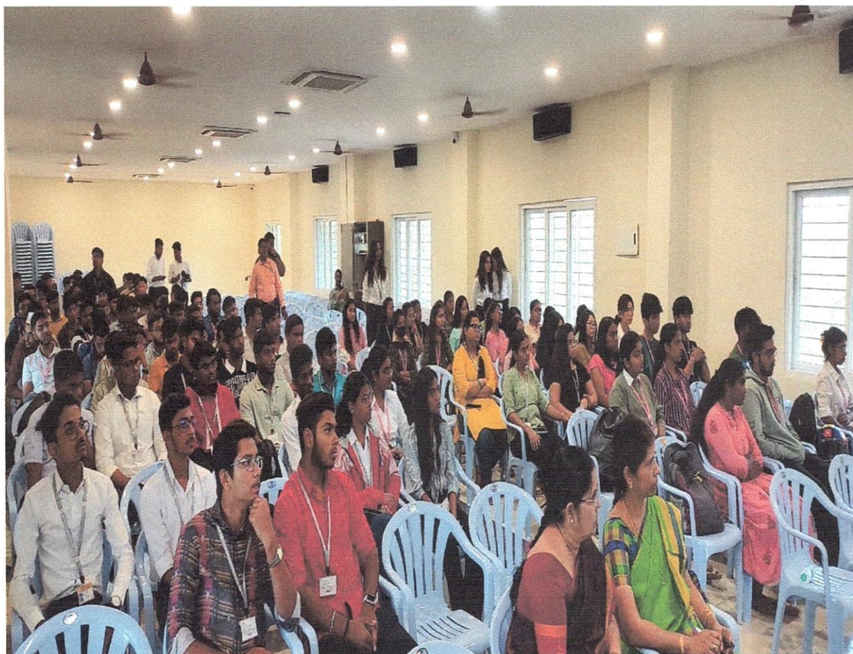
Participants of the programme

THEME: ARTIFICIAL INTELLIGENCE (AI) – PRODUCTIVITY ENGINE FOR ECONOMIC GROWTH WITH A FOCUS ON AI – FOR IMPROVING AGRICULTURAL PRODUCTIVITY