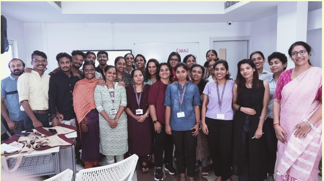
"Employment development training programme for Productivity improvement" conducted on 17 th February, 2024 at Choice Foundation, Tripunithura, Ernakulam