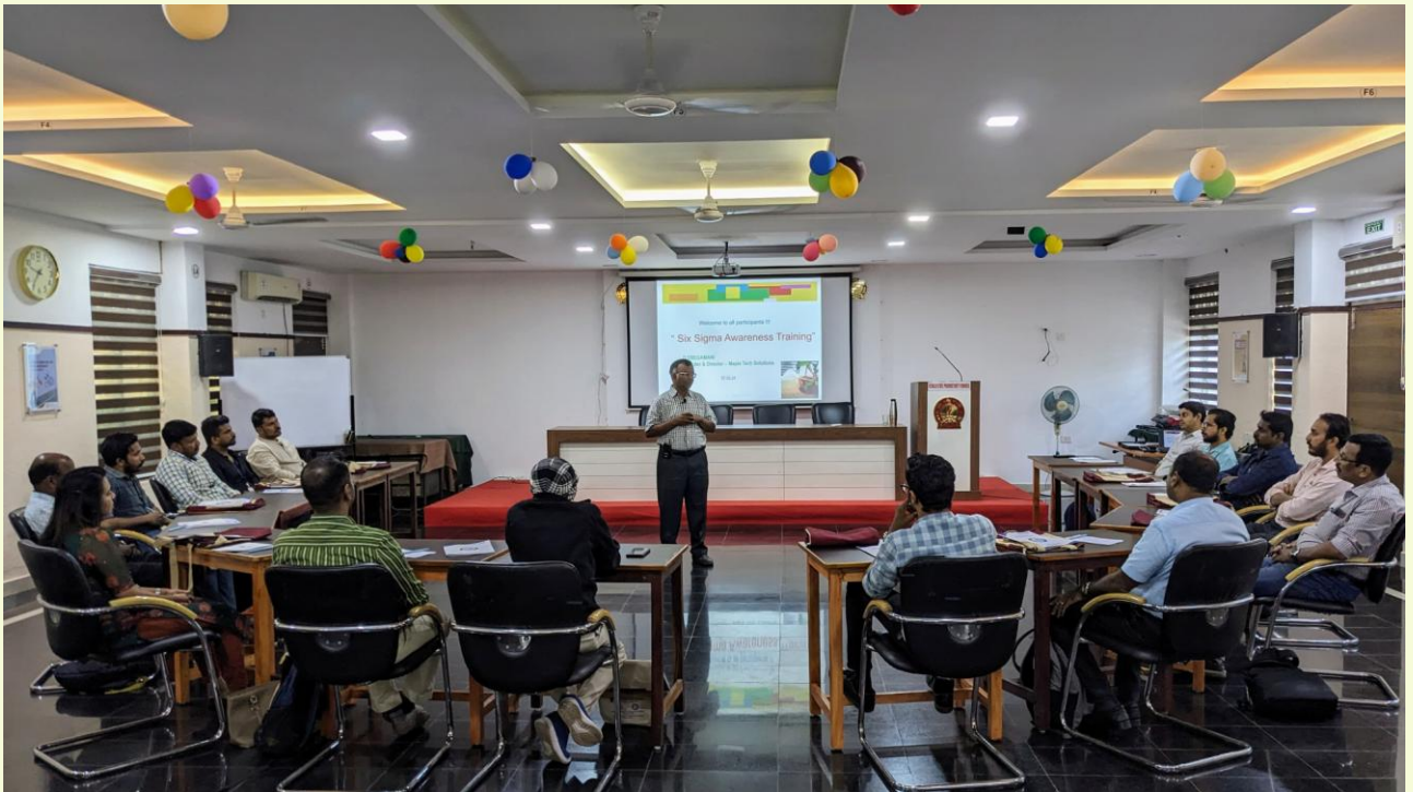
Training programme on "Productivity Improvement & Six sigma methodology" conducted on 7 th February, 2024 at Productivity House, Kalamassery