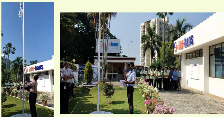
Ray-hans Precision Tools Pvt. Ltd., Kakkanad, Ernakulam