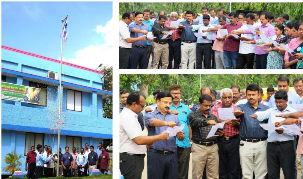
HLL Lifecare Ltd., Akkulam Factory, Thiruvananthapuram