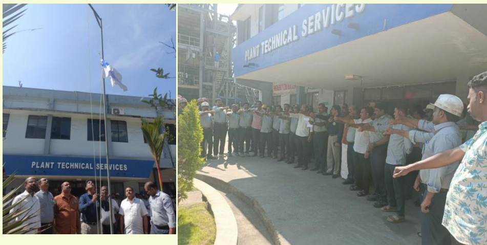
Kerala Minerals and Metals Ltd., Chavara, Kollam