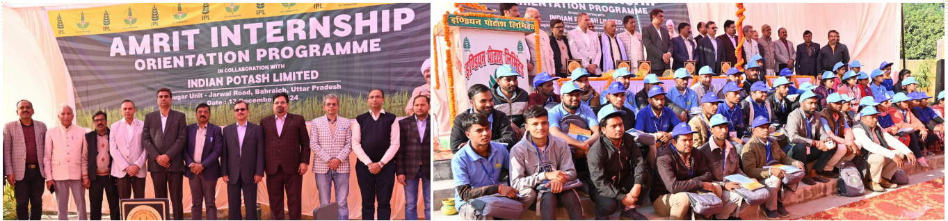
Orientation Programme at IPL Sugar Unit, Jarwal Road, Uttar Pradesh on 13th December, 2024

"Empowering Growth Together: Interns and Farmers Unite for Agriculture!"