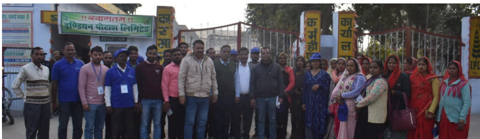
Khadda, Uttar Pradesh on 14th December, 2024