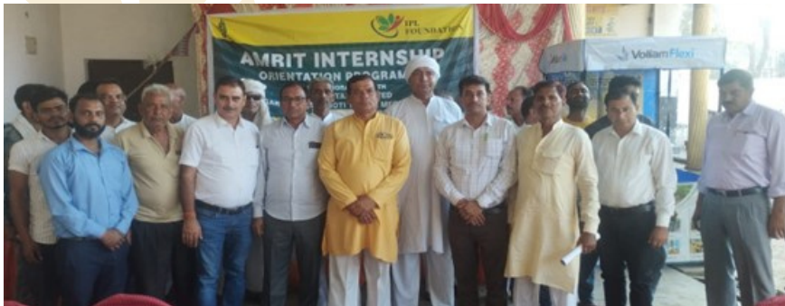
Sakhoti Tanda, Uttar Pradesh on 24th October, 2024

IPL Foundation has recently organised 3 Farmers meet in collaboration with IPL Sugar Unit Sakhoti Tanda and Khadda, Uttar Pradesh.