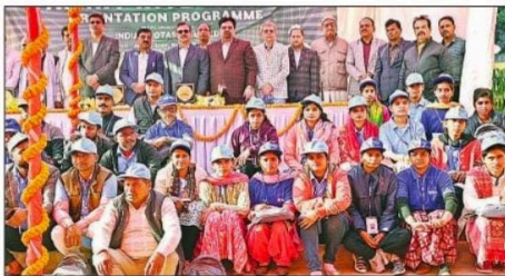
चीनी मिल में मौजूद अधिकारी और अतिथि अग्र्यर्थी।

मुख्य अतिथि ने उद्बोधन से प्रतिभागियों को संबोधित करते हुए कहा कि यह कार्यक्रम ग्रामीण युवाओं के लिए सुनहरा अवसर है