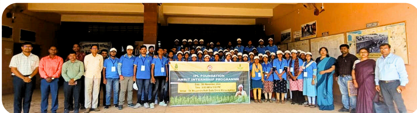
Orientation Programme at Dr. Bupendra Nath Dutta Smriti Mahavidyalaya in Purba Bardhaman, West Bengal on 9th November, 2024

"Empowering Growth Together: Interns and Farmers Unite for Agriculture!"