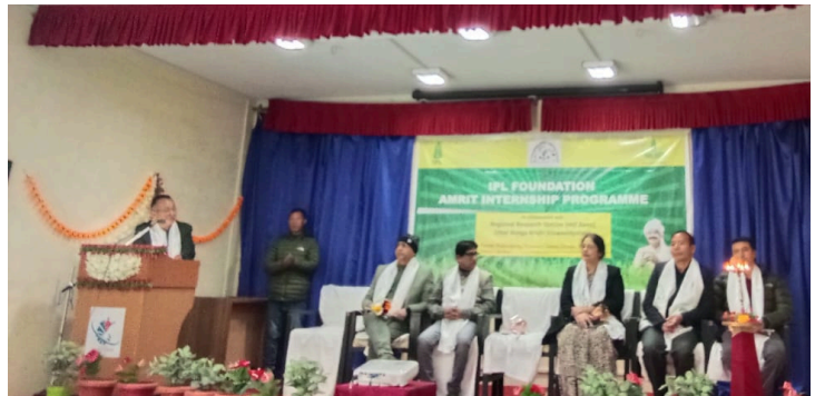
Orientation Programme at Uttar Banga Krishi Viswavidyalaya at Kalimpong, West Bengal on 17th December, 2024