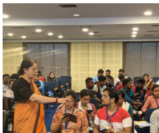
Orientation Programme at Sidho-Kanho-Birsha University in Purulia, West Bengal on 12th November, 2024