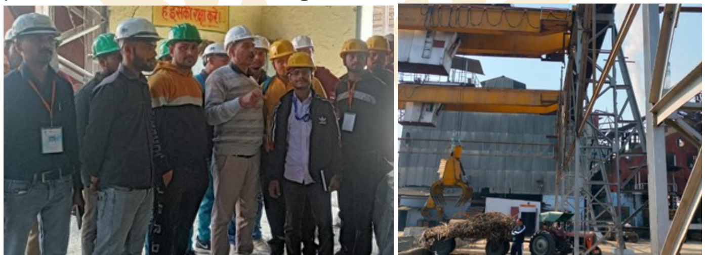
Snippets of Industry visit at IPL Sugar Unit, Sakhoti Tanda, UP on 30th November, 2024

The visit provided interns with valuable hands-on exposure, bridging theoretical knowledge with real-world applications. It underscored the importance of sustainability, quality control, and industrial efficiency, inspiring potential career interests in the agro-industrial domain.