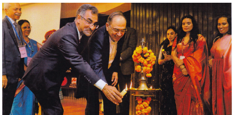
SNIPPETS OF SAMBHAV' 2024