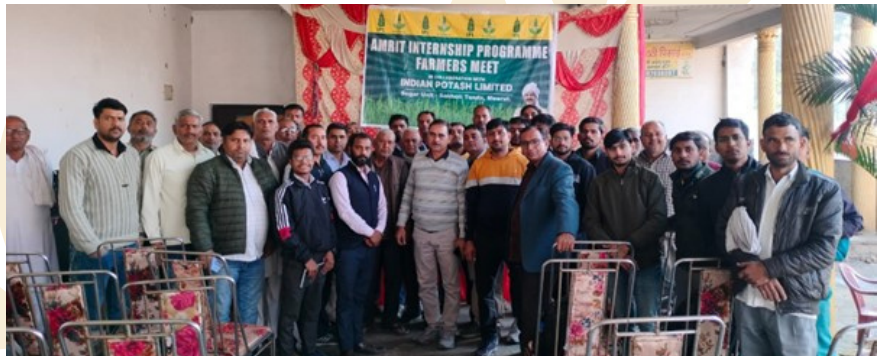
Sakhoti Tanda, Uttar Pradesh on 30th November, 2024