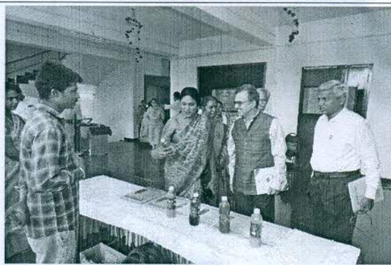
Stalls view by the dignitaries