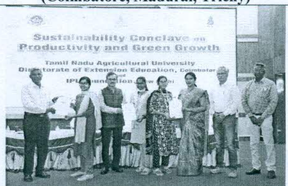
Distributed Best Poster Awards for PG Students