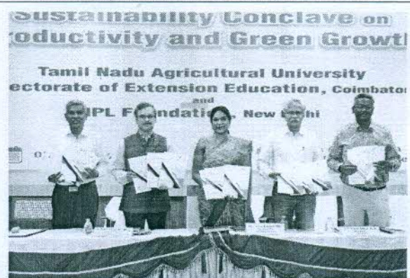
Book Release on Amrit Internship Programme – TNAU’s Experience (Coimbatore, Madurai, Trichy)