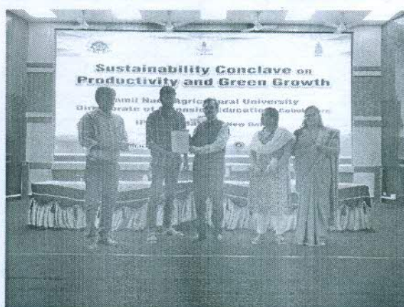
Distributed the Participation Certificate