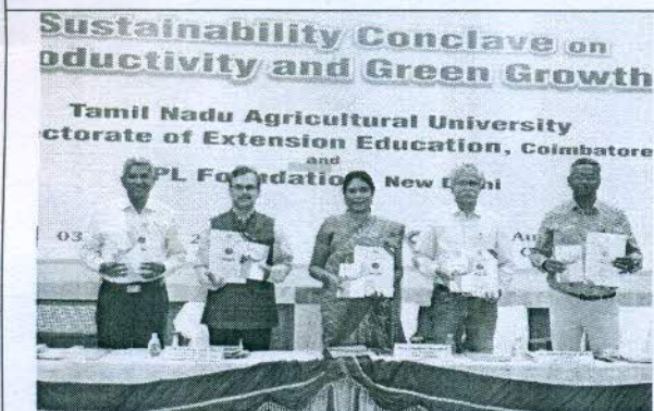
Release on Handbook for Amrit Interns & E-Learning Module for Amrit Internship Programme