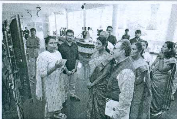
Student explaining e-poster to the dignitaries